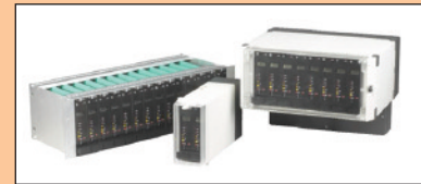
GDS2010 Multi Channel Gas Monitor